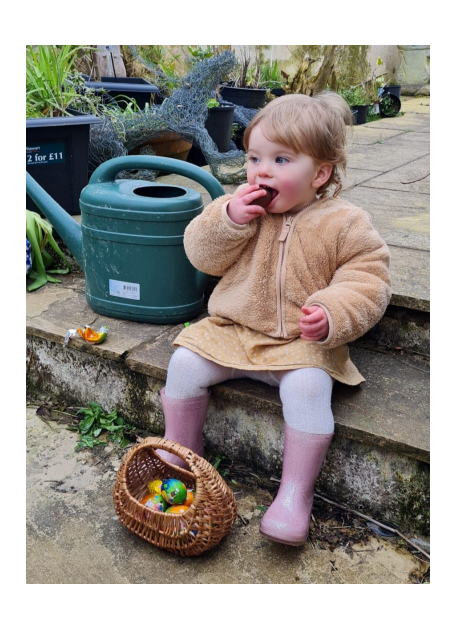
Above - Easter Egg Hunt on Easter Sunday.