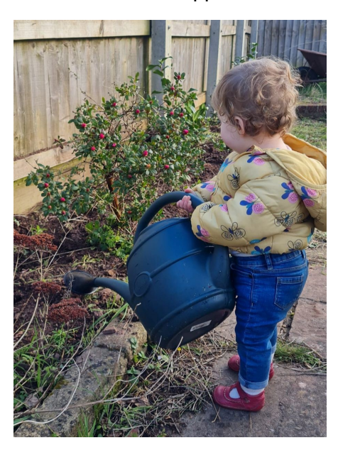
Above - time spent outdoors during the milder weather, often in brief moments between rain showers.