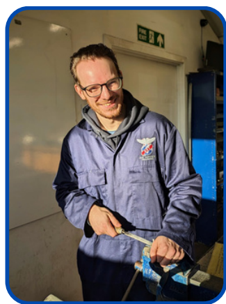
Filing in the hand skills workshop