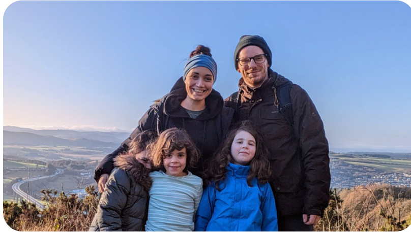
Hike up Kinnoull Hill overlooking Perth