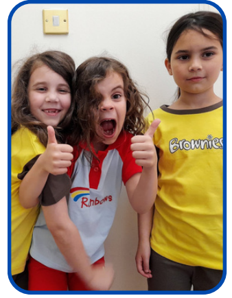
Girls have joined local girlguides groups