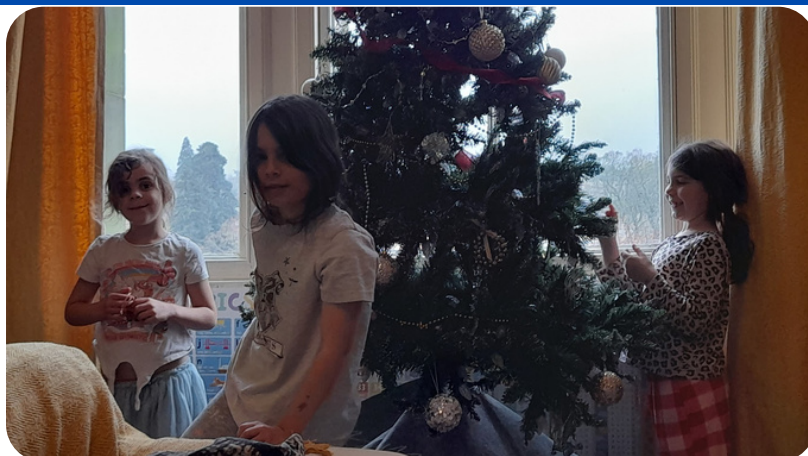
First Christmas in Scotland