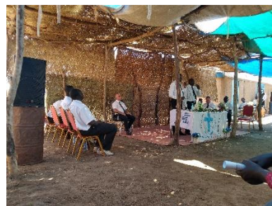
(left) The passengers being welcomed by a group of children in Ba-illi. (Right) Amongst the congregation for the 'Divine service'