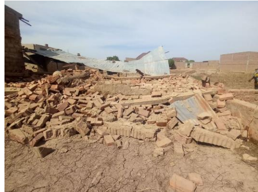
(Left) Photo of her house before the flooding (Right) The current state of her house Sarah with the children she adopted in 2019