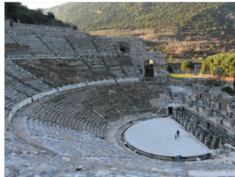
(left) Feeling cold after a fun morning playing in the snow. (right) Testing the acoustics in the Great Theatre in Ephesus

MAF encourage us to take a break from Chad each year and so last month we took a holiday to Turkey. The kids had never seen snow before so we visited Kayseri (Cappadocia) and drove up Mount Ericyes. We were all excited to find that a recent snowfall had produced at least a foot of snow and with hardly anyone around, we had a wonderful morning throwing snowballs, making a snowman and sledging at the bottom of a ski slope. We stayed in a cave in Cappadocia, had some amazing walks through the unique landscape and watched hundreds of hot air balloons take to the sky at sunrise on a crisp winter morning. We spent two days in Ephesus, which was fascinating and spent a fun week in Istanbul. We found an English-speaking church