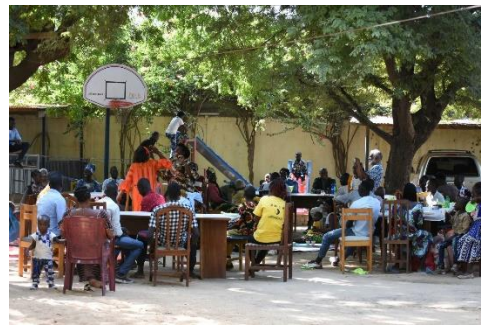
(top) Playing Tug o' War and (bottom) Listening to a song sung in French before the start of the awards ceremony and speeches