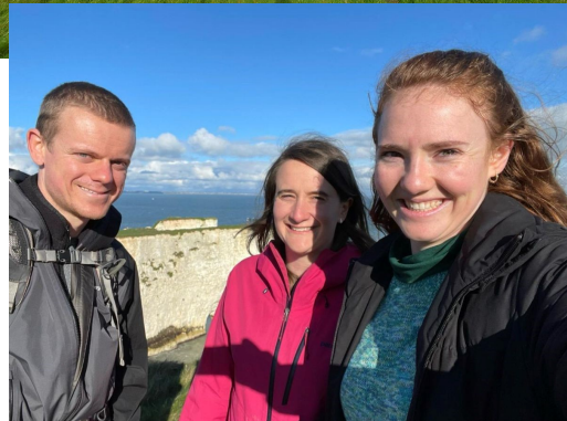
Winter walks: by our local river; in flood (Top), the Purbecks, Portsmouth and Old Harry Rocks