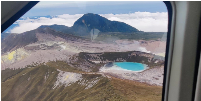
Above: Flying over the centre of the island, checking the heights of the volcano peaks, we could smell the sulphur in the air.

Since being back the team have submitted a report to MAF International for review and consideration, and to see if this may form part of MAFI's vision for 'more people, more places, more impact'