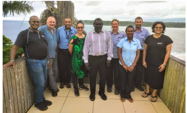
Below : The team meeting with the Hon. Ishmael Taorama President for the Autonomous Bougainville Government