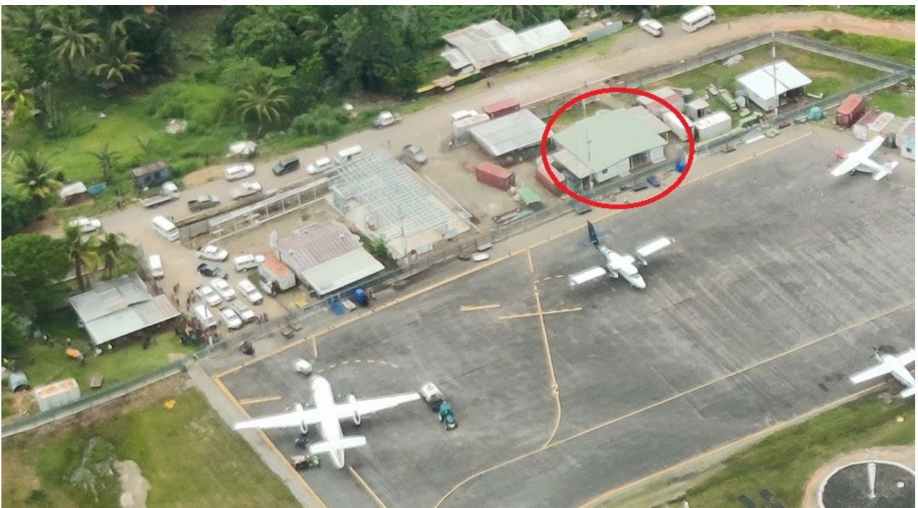
The new MAF Facility built by the NAC, and adjacent to the construction of the new Main terminal building

It is a real testament therefore to the impact and respect that the NAC has for MAF that when they came to develop a new terminal building which required extending into our existing base facility that the NAC offered to build MAF a complete new facility free of charge for us upgrading us to a new facility, from our rather tired old container offices, which meets our continued Passenger and Cargo requirements and providing us with a facility fit for the next 30-40 years.